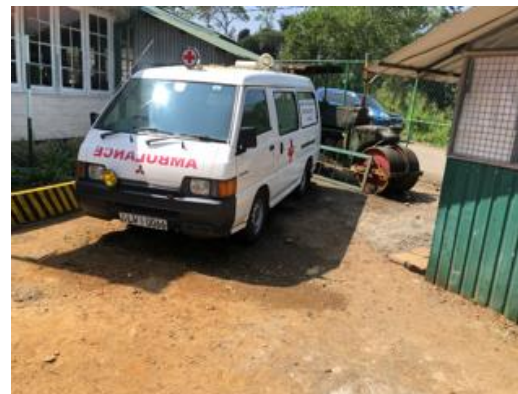
First aid kit available free of charge to workers being organized