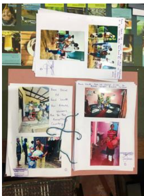
Record of Social Contribution Activities

*We plan to conduct a survey of the current status of other major supplier farms based on this response.