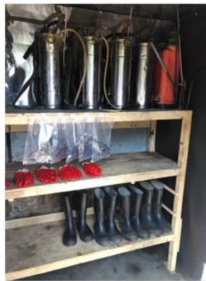
Personal protective equipment