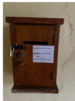
Operation of Complaints and Suggestions Box