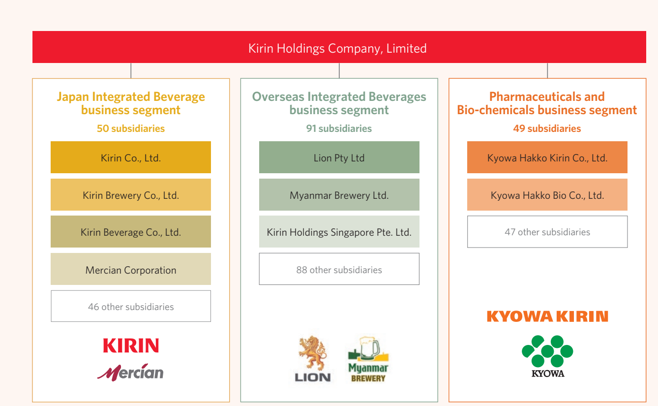
Note: The Other business segment includes Koiwai Dairy Products Co., Ltd., and one other company.

Operational scale and profitability of operating companies