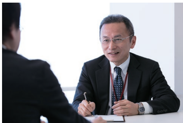
Coaching by outside coaches

In May, as the first phase of implementation under the action plan, we began implementing regular one-on-one coaching by outside coaches and conducting workshops in divisions and other units. In July, all participants pronounced the senior leader action declaration to every employee. After that, we evaluated the results of initiatives by re-implementing the 360-degree survey, conducting member interviews, and implementing the employee engagement survey. At the same time, we have continually improved the program's content. We will continue to carry out organizational culture reforms by encouraging self-change from senior management to mid-level leaders and all employees.