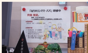
The desks of participants in the program to simulate the work-styles of mothers and fathers

Kirin's Program to Simulate the Work-Styles of Mothers and Fathers, which started in 2016 with female sales department employees, is in fact an attempt to get employees without children to act, through simulated experience, as though they are working mothers and fathers. Because a parent's time is restricted by child rearing and emergencies such as a child coming down with a fever, we are promoting an understanding of diverse working styles, reviewing how a person and the organization work, and improving work efficiency through simulated experiences that efficiently improve work by gaining the cooperation of those around us. Since the program's inception, there have been significant results such as productivity improvement. Therefore, in 2018, we expanded it to cover the entire company. Further, the program has been expanded so that employees can select from the three simulated scenarios of childcare, nursing care, and family illness.