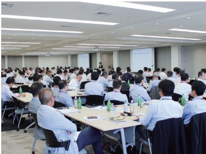
2017 senior leader session

With this understanding, the Kirin Group established a policy of changing the awareness and actions of senior leadership. The Group also launched a leadership development program in fiscal 2017 for about 130 employees of senior leaders including directors of Kirin Holdings, the top management of major operating companies, and the heads of offices and divisions nationwide. This program was developed in conformity with conditions in Japan while drawing on the program of Lion Pty Ltd. of Australia.