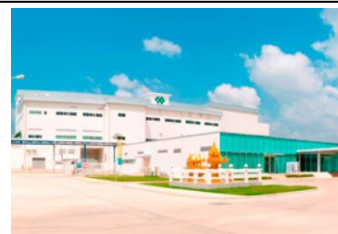
Thai Kyowa facility